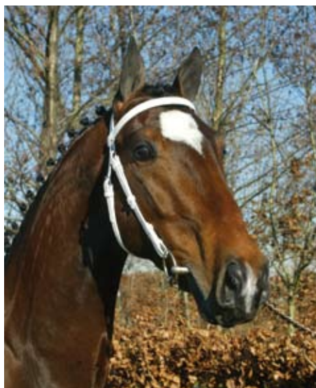
Zeppelin's beautiful head