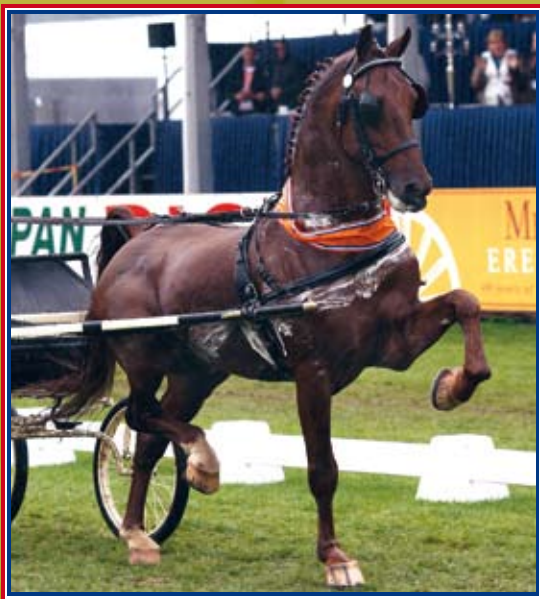
Stuurboord Champion in harness & unique bloodlines!