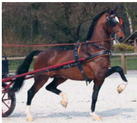
Zeppelin , impressive at the performance test in Ermelo