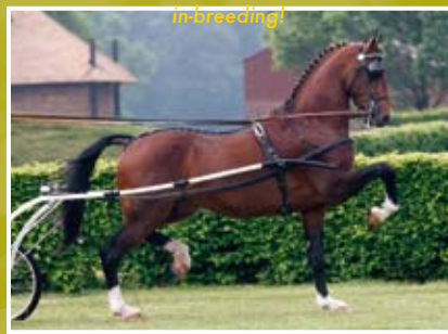
Zeppelin Climbs to great heights!

Your black equine partner in the fight against inbreeding!