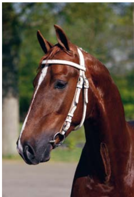
Aquarel's noble head