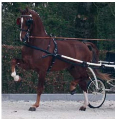
Aquarel at the performance test in Ermelo