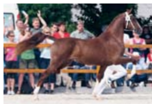
Aurose (Unicko x Fabricius); Ibop-topper top IBOP horse of 2008 (89 points) Breeder/Owner: Th. Postma, Kollumerpomp